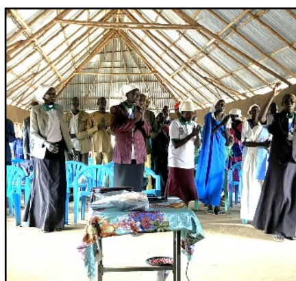
Conference worship, Maiwut