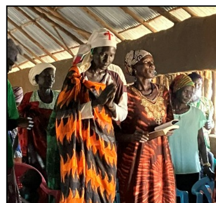
Conference participants, Maiwut