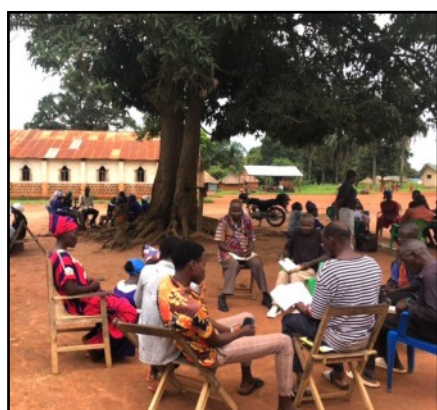
A RinJ practice group, Nzara