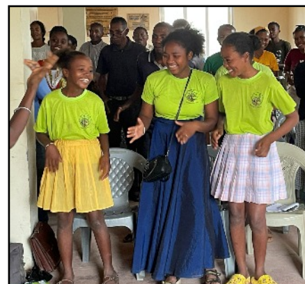
Left: sharing in a practice group, Zambezia. Centre: RinJ Junior conference, Zambezia. Right: Young graduates of RinJ train to lead RinJ Junior, Toliara