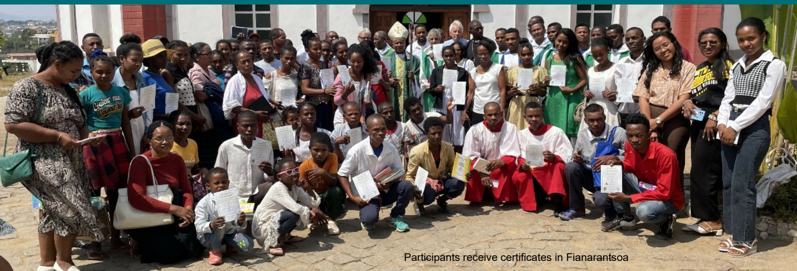
Participants receive certificates in Fianarantsoa